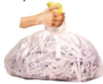
Shredded Paper (bagged and tied securely!)