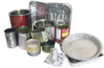
Cans and aluminum containers

Keep your recyclables clean and loose in cart, do not place in bags